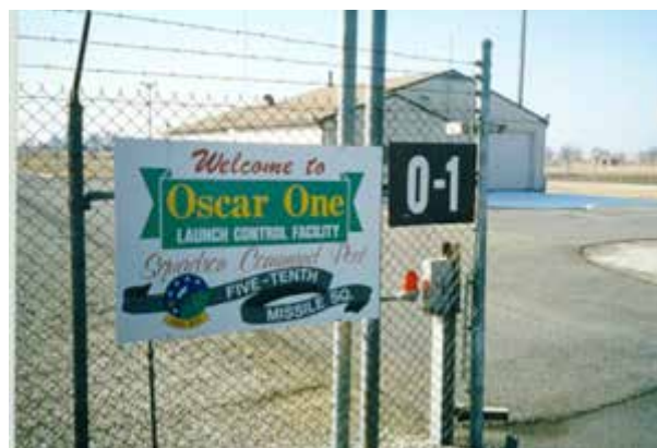
Oscar One at Whiteman

When we returned from our second alert the day after Christmas, our crew became an Instructor Crew, so, while we had a few alerts the next several months, we spent most of our time training a flood of newly arriving crews as they were cranked out of the 4315 CCTS. By mid-summer, we had an entire squadron of missiles and five launch control centers up and running, with more coming over the next year.