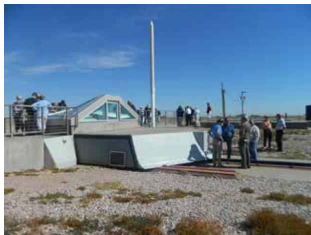
AAFM Members at Launch Facility D-09

In the lower left quadrant of the painting we see a maintenance convoy from Ellsworth AFB approaching Delta-09. The convoy consists of a group of security forces personnel in the lead vehicle followed by a transporter-erector, and a maintenance van bringing up the rear (this was the standard configuration for a missile convoy in the 1960s). We may imagine that the convoy is headed for Delta-09 to remove the missile for shipment to Vandenberg AFB in California where (equipped with a dummy warhead in place of its live nuclear round), it would be test-launched as a part of the Strategic Air Command's Follow-On Test and Evaluation (FOT&E, or "foot") program. Under the provisions of this program, missiles were selected at random from time to time (legend has it that the missiles were selected by drawing their site numbers from a hard hat) and shipped to the Air Force's Western Test Range at Vandenberg. Once there and in place, they were launched just as if they had received a valid launch order from SAC at their operational base. In this way the Air Force not only gained valuable data about the missiles' performance, but the missile launch crews and teams of maintenance and support personnel received valuable training in an actual launch environment.