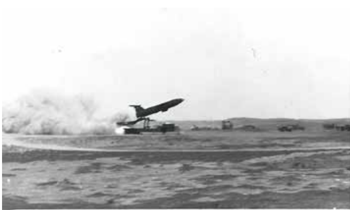
A Matador Lifting Off

It rose swiftly at an acute angle leaving behind a trail of smoke.