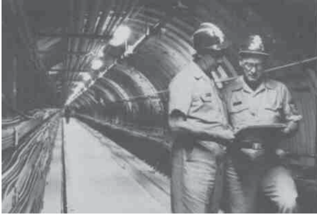
Titan I Tunnel to the Silos

both officer and enlisted, ended up in temporary jobs around the base in the 9th Bomb Wing or the support units. A few of us were left in the squadron to complete the closedown of the unit. I was a junior captain - less than one year in grade - but I ended up being the senior maintenance officer still in the missile squadron. I came back from Squadron Officers School in early January 1965, so I had about four months of "casual" duty. Those of us still in the squadron got a few special projects, inventories and investigations from the bomb wing, but we spent most of our time at the office, at the gym, the base indoor pool or the bowling alley. It's too bad there weren't computer games in those days, since it might have filled some of that dead time.