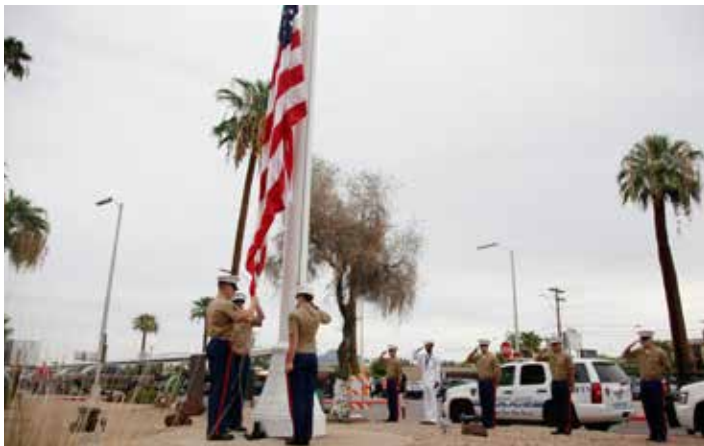
Marines Raising the Flag