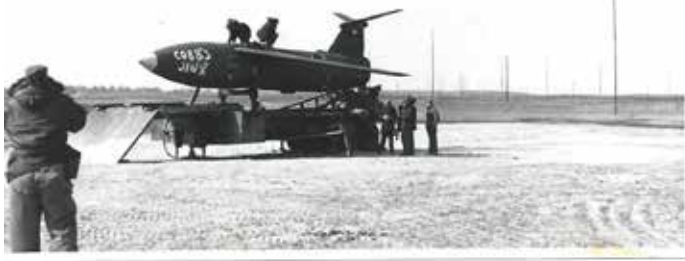
“Cobb’s Jinx” Being Readied for Launch