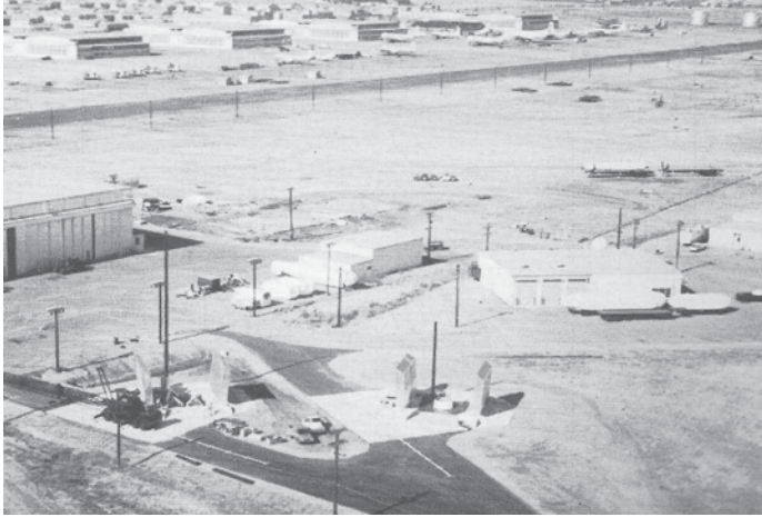
Sheppard Missile Training Launch Facilities

were very large, very basic and only capable of a series of simple tasks. This block was four weeks long.