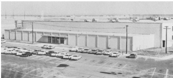
Neel Kearby Hall Missile Training Facility

The second block was called “Electronics for Missiles” and included a lot of time in the laboratory. We built simple circuits and even studied how a new idea, magnetic core storage of data, worked in the brand new computers we would be dealing with. Remember that in 1961, computers