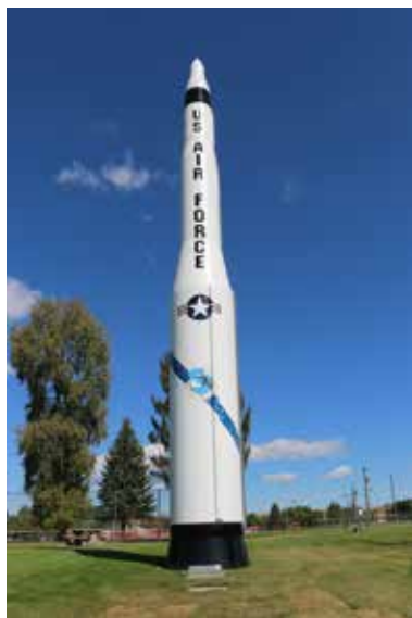
The Restored Lewiston Minuteman